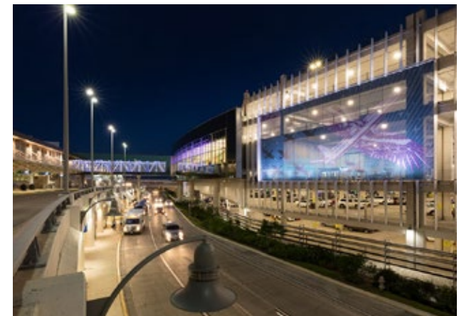
San Antonio International Airport - CONRAC