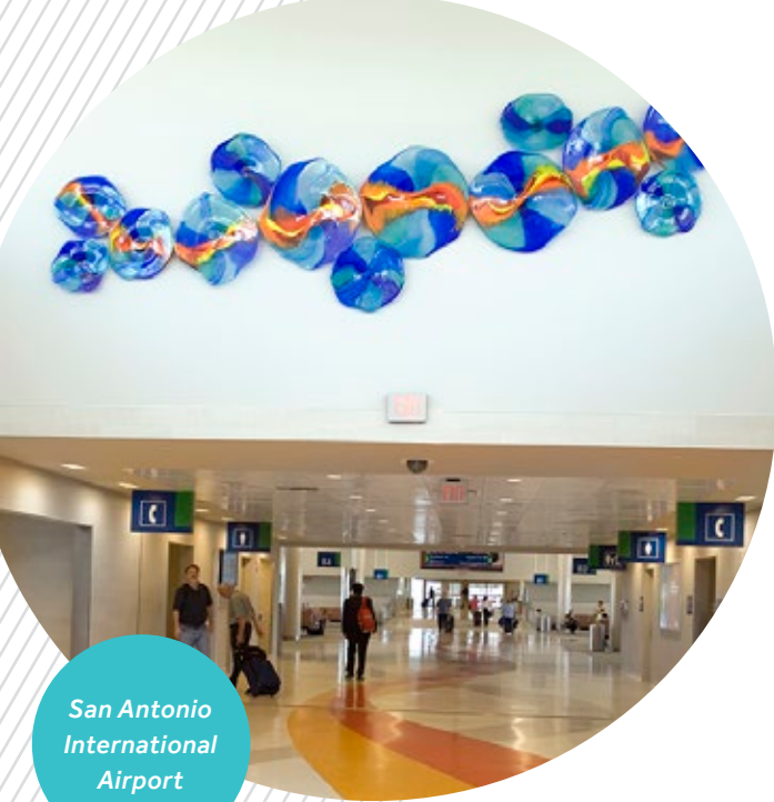
San Antonio International Airport

"Foster CM Group was an integral part of the program management team directing the efforts of the airport expansion."