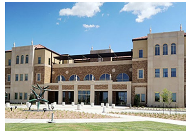
Texas Tech University Health Sciences Center