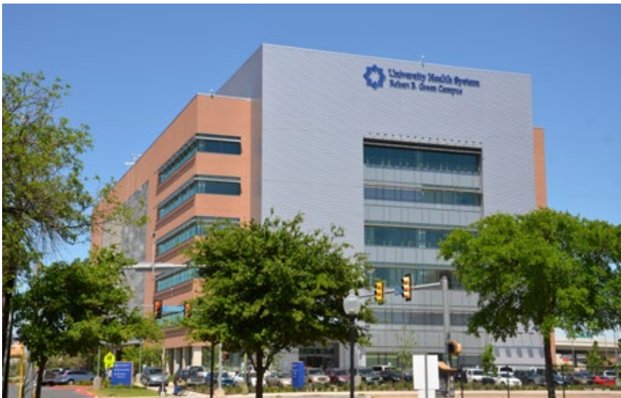
University Health System

Since 1992, Foster CM Group has provided program/construction management-related services to major healthcare systems, hospitals and clinics, and academic medical centers and we understand the demand to stay abreast of every facet of the industry's ever-increasing standard. Our experience in managing the construction of billions of dollars in state-of-the-art healthcare facilities continues to drive us into the next realm of building the hospitals of the future.