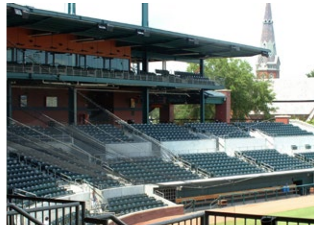
Jacksonville Baseball Grounds