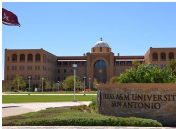
Texas A&M University - San Antonio