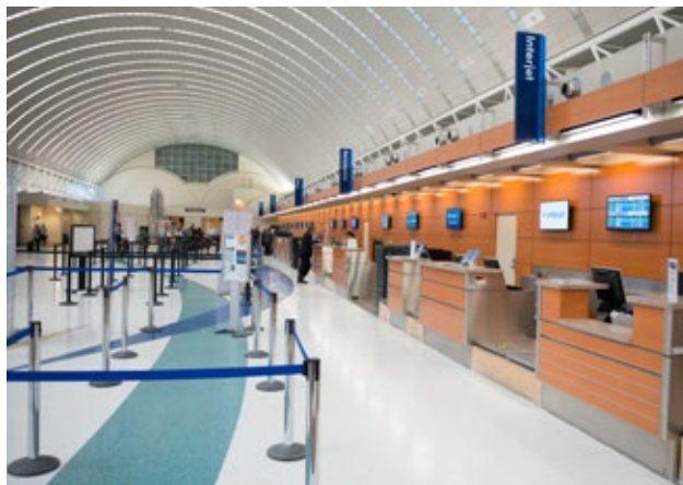
San Antonio International Airport

Airports have brought about high demand for experienced program management, construction management and QA/QC inspection teams to oversee their expansion programs. Foster CM Group has been involved in managing terminal expansions, runway/taxiway expansions and improvements, parking expansions, FAA anti-noise programs and improvements to concessions programs for more than 27 years and has the experience and the know-how to get the job done.