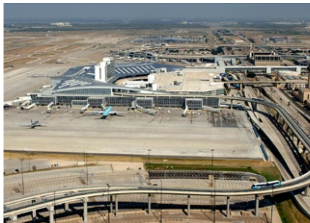
Dallas/Fort Worth International Airport