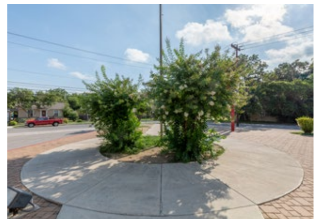
City of San Antonio - Federally Funded Sidewalks Program