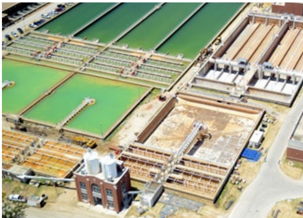
Bachman Water Treatment Plant

For more than 27 years, Foster CM Group has worked with utilities and governments providing program/construction management-related services to help meet the needs for exceptional water quality, solve water shortage and distribution issues and develop wastewater treatment systems to meet today's environmental challenges. And today we continue to provide quality, trustworthy services to water/wastewater clients and grow the company based on our successful reputation and rock solid relationships. Throughout the years, Foster CM Group has provided program/construction management related services on nearly $1 billion in water/wastewater construction including projects such as water treatment plants, wastewater treatment plants, distribution pipelines, sewer pipelines and storage and recovery facilities.