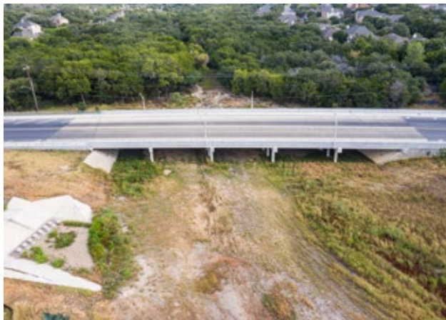
Bexar County - Prue Road at French Creek

The modernization of transportation infrastructure—whether it's a two-lane rural roadway or the most complex of urban highway interchanges—is paramount to the success of any community's growth. Foster CM Group has helped fuel the success of our Nation's transportation infrastructure by providing superior program/construction management, inspection and record keeping services for local, state and federal transportation authorities. Having managed more than $250 million in transportation construction, Foster CM Group, with the help and direction of its experienced and knowledgeable civil/transportation staff, has established resources and systems ensuring that projects are completed on time, within budget and to each client's highest standards and expectations—all while implementing successful audit-proof oversight to ensure project accountability and quality.