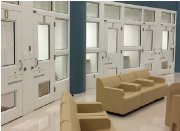
Dallas County Jail