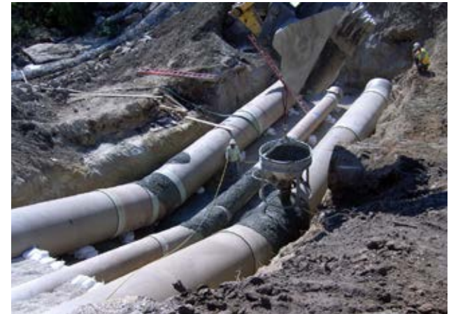
Southwest Bexar Pipeline