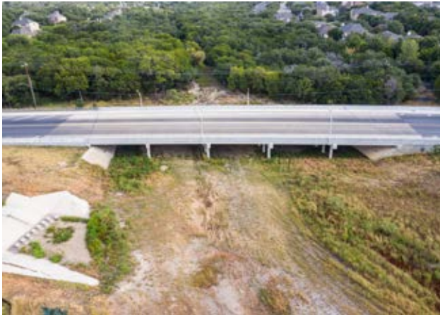
Bexar County - Prue Road at French Creek

The modernization of transportation infrastructure—whether it's a two-lane rural roadway or the most complex of urban highway interchanges—is paramount to the success of any community's growth. Foster CM Group has helped fuel the success of our Nation's transportation infrastructure by providing superior program/construction management, inspection and record keeping services for local, state and federal transportation authorities. Having managed more than $250 million in transportation construction, Foster CM Group, with the help and direction of its experienced and knowledgeable civil/transportation staff, has established resources and systems ensuring that projects are completed on time, within budget and to each client's highest standards and expectations—all while implementing successful audit-proof oversight to ensure project accountability and quality.