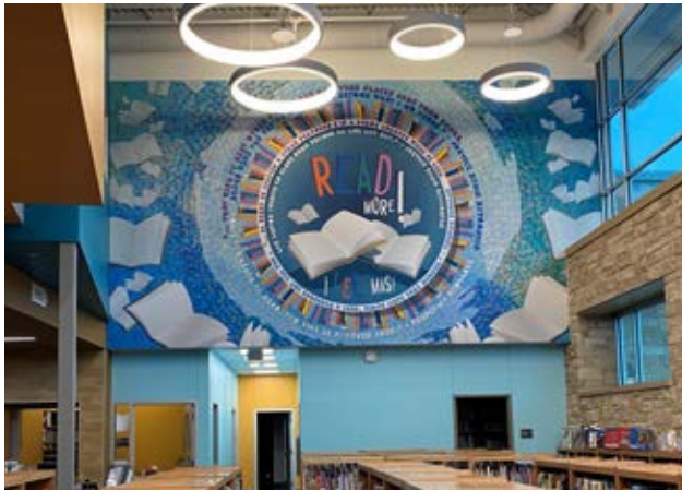
Austin ISD - Govalle Elementary School

With constant growth in the U.S. comes an ever-increasing need to improve and/or replace overcrowded and aging school systems and infrastructure. Having managed the construction and/or renovations of more than $2.2 billion K-12 and Higher Education educational facilities including classrooms, sports venues, fine arts facilities and healthcare/laboratory spaces, Foster CM Group has successfully assisted education systems in meeting their program and improvement goals while always keeping the budget, the schedule, the quality of the work, and most importantly, the safety of the students, faculty and staff, in mind.