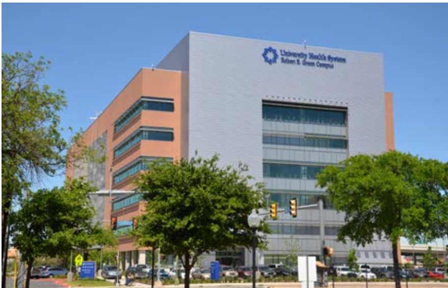
University Health System

Since 1992, Foster CM Group has provided program/construction management-related services to major healthcare systems, hospitals and clinics, and academic medical centers and we understand the demand to stay abreast of every facet of the industry's ever-increasing standard. Our experience in managing the construction of billions of dollars in state-of-the-art healthcare facilities continues to drive us into the next realm of building the hospitals of the future.