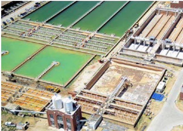
Bachman Water Treatment Plant

For more than 27 years, Foster CM Group has worked with utilities and governments providing program/construction management-related services to help meet the needs for exceptional water quality, solve water shortage and distribution issues and develop wastewater treatment systems to meet today's environmental challenges. And today we continue to provide quality, trustworthy services to water/wastewater clients and grow the company based on our successful reputation and rock solid relationships. Throughout the years, Foster CM Group has provided program/construction management related services on nearly $1 billion in water/wastewater construction including projects such as water treatment plants, wastewater treatment plants, distribution pipelines, sewer pipelines and storage and recovery facilities.