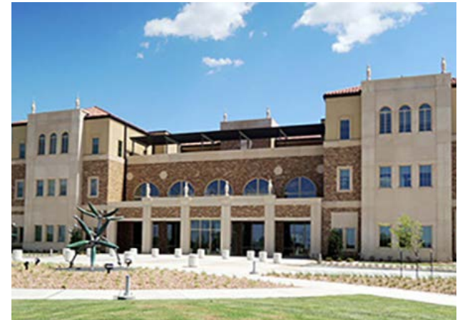
Texas Tech University Health Sciences Center