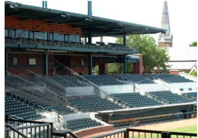
Jacksonville Baseball Grounds