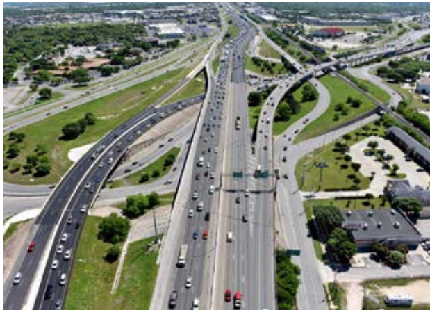
TxDOT I-35 RED