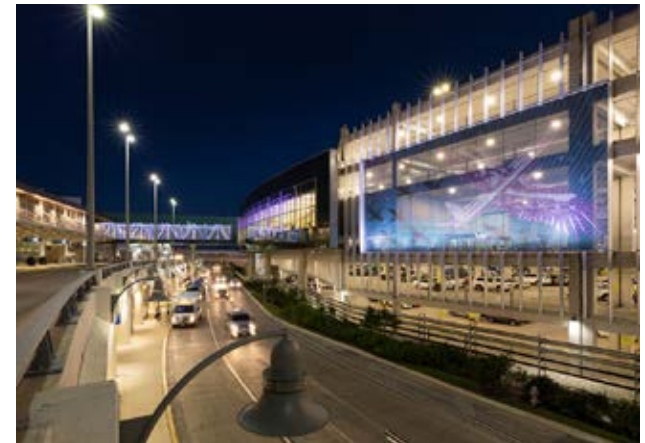
San Antonio International Airport - CONRAC