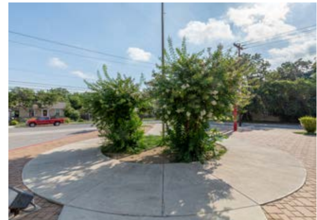
City of San Antonio - Federally Funded Sidewalks Program