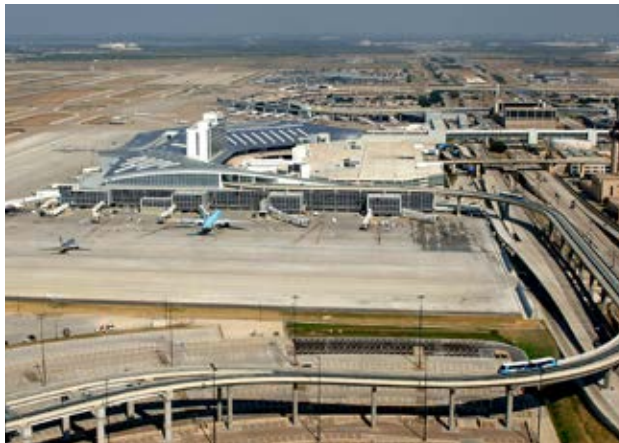
Dallas/Fort Worth International Airport