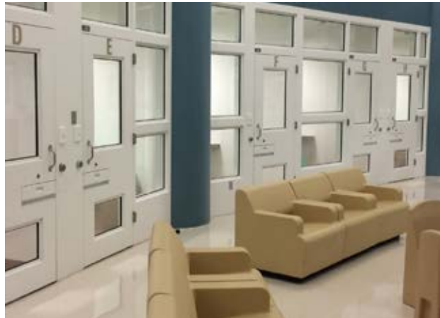
Dallas County Jail