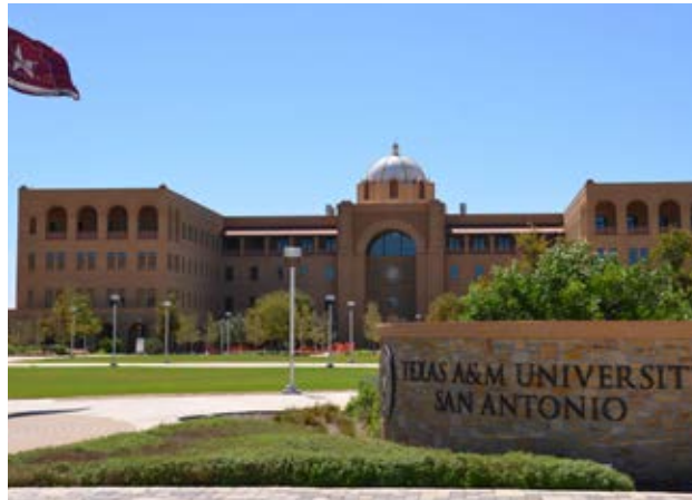
Texas A&M University - San Antonio