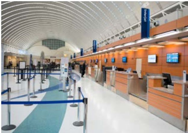
San Antonio International Airport

Airports have brought about high demand for experienced program management, construction management and QA/QC inspection teams to oversee their expansion programs. Foster CM Group has been involved in managing terminal expansions, runway/taxiway expansions and improvements, parking expansions, FAA anti-noise programs and improvements to concessions programs for more than 27 years and has the experience and the know-how to get the job done.