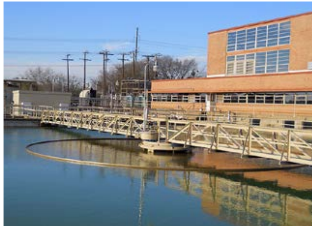
Park Cities Water Treatment Plant