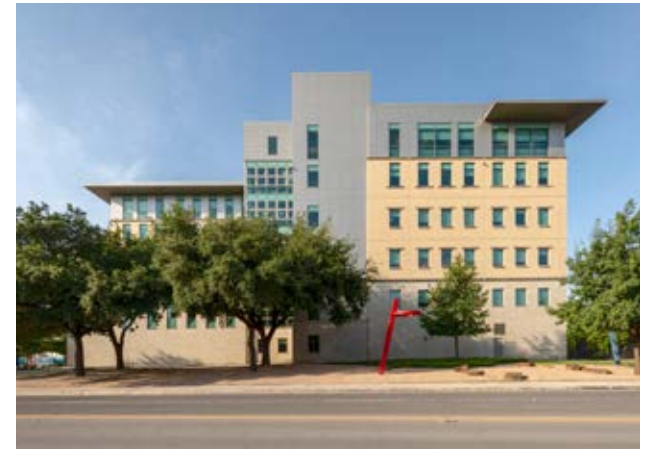
San Antonio Public Safety Headquarters