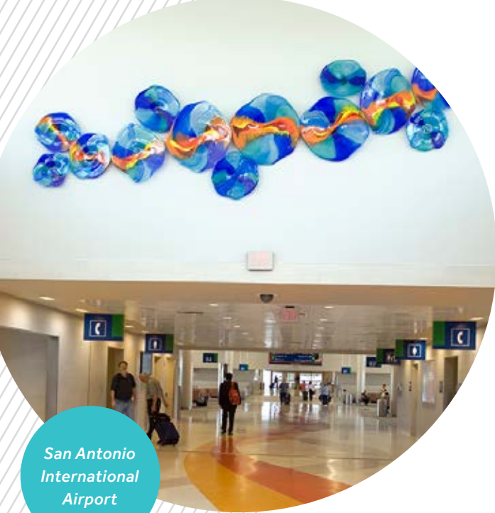
San Antonio International Airport

"Foster CM Group was an integral part of the program management team directing the efforts of the airport expansion."