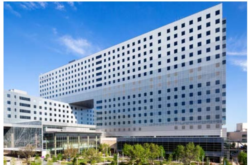
Parkland Health & Hospital System